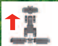
COMBINATION 1: FRONT & REAR MOUNTED