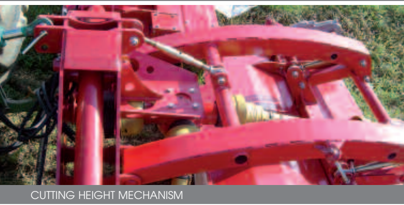
CUTTING HEIGHT MECHANISM