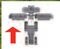
COMBINATION 2: REAR MOUNTED FOR BI-DIRECTIONAL TRACTORS