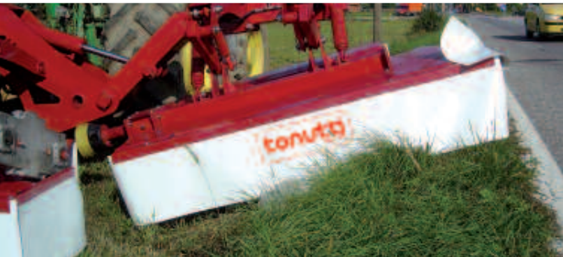
PERFECT GROUND ADAPTATION

Large area mowing and high volume harvesting are more and more important and the Tonutti combination mowers and mower-conditioners represent the ideal solution for contractors and large producers by optimizing mowing and drying time and by providing the highest forage quality.